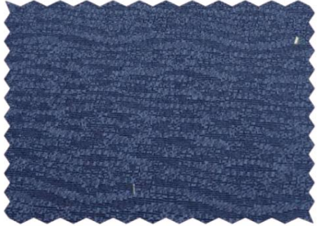
Fabric: DAW5567 Fabric Content: 65T35V Gram Weight: 265g/m 2