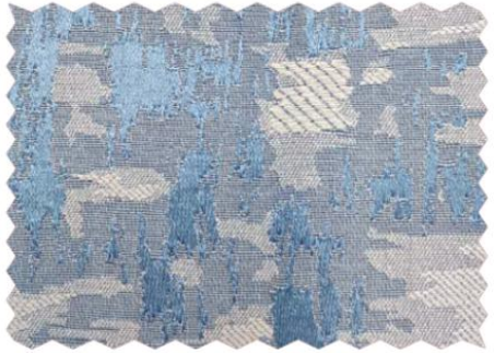
Fabric: DAW5560 Fabric Content: 65T35V Gram Weight: 350g/m 2