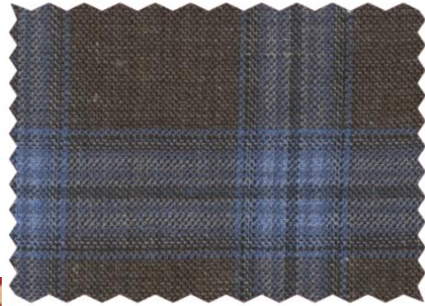
Fabric: DBU040A Fabric Content: 62W28S10LI Gram Weight: 250g/m