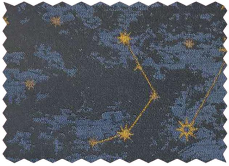
Fabric: DBT1501 Fabric Content: 60P40W Gram Weight: 213g/m 2